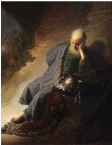
Pages 6-8, paintings and sketches by Rembrandt at the Rijksmuseum, (above) the Prophet Jeremiah by Rembrandt

In my book, no-one can better Rembrandt and his use of light. For me, he is the greatest!