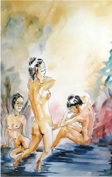
Watercolour by Bob Milton (see page 9)