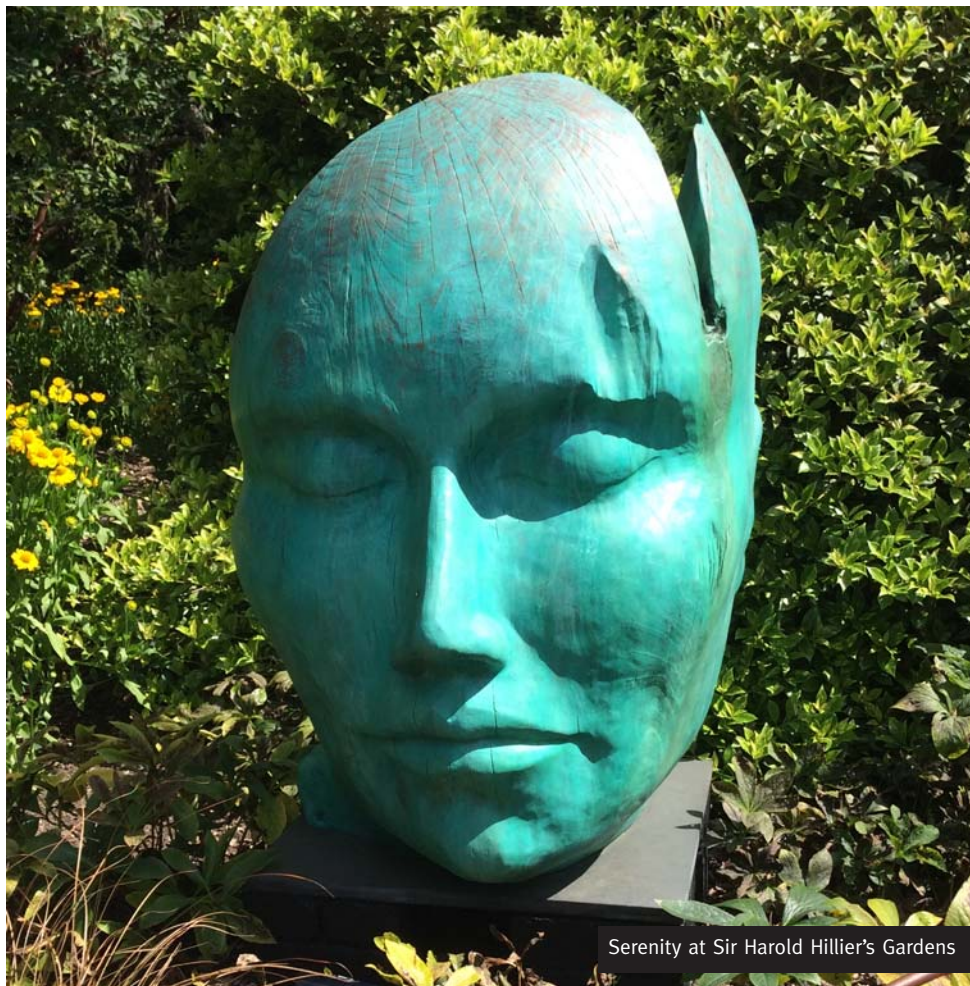
Serenity at Sir Harold Hillier's Gardens